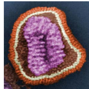
Figure 4 (right) - Influenza. Pseudo-colored transmission electron micrograph (TEM) of an influenza virion.