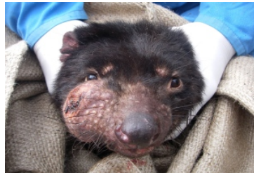
Figure 2 (right) – Devil Facial Tumor Disease. Image of Tasmanian Devil suffering from a large tumor on its snout. Note that the tumor is obstructing the range of vision in one eye and likely causing difficulty in eating.