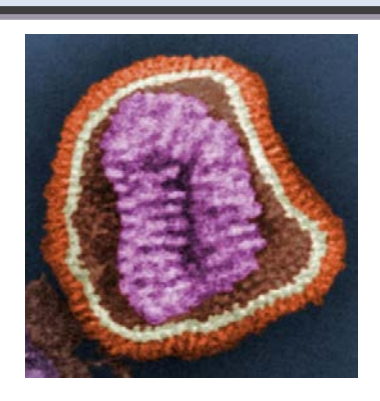
Figure 4 (right) - Influenza. Pseudo-colored transmission electron micrograph (TEM) of an influenza virion.

Figure 3 (left) – DFTD. Effect of DFTD on the growth rate of the devil population on the Freycinet Peninsula, Tasmania (black) and the prevalence of DFTD in the total devil population over the same time period (red). From: McCallum. 2008. Trends in Ecology and Evolution 23: 631-637.